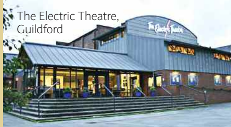
The Electric Theatre, Guildford

Visit our website at www.surreymozartplayers.com