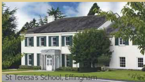
St Teresa's School, Effingham