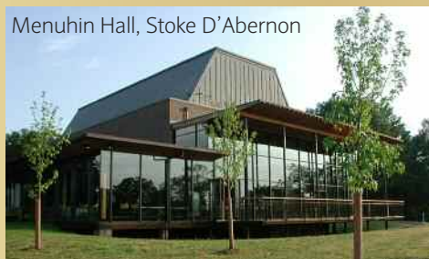
Menuhin Hall, Stoke D'Abernon